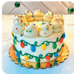
RETRO CHRISTMAS LIGHTS